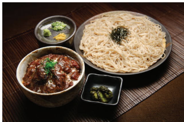
Friday - Hayashi Rice