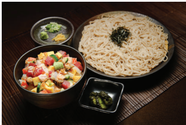
Thursday - Bara Chirashi Don