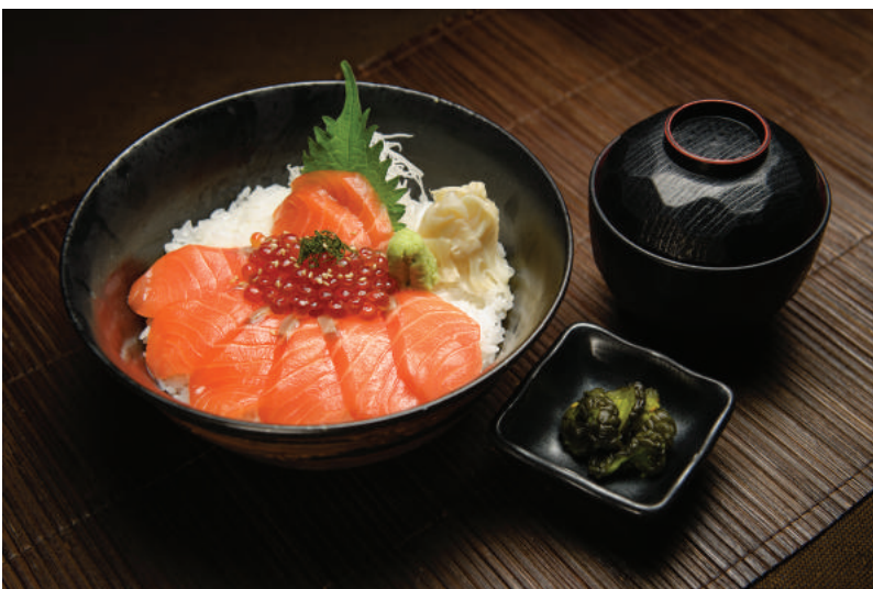
Sake Ikura Don