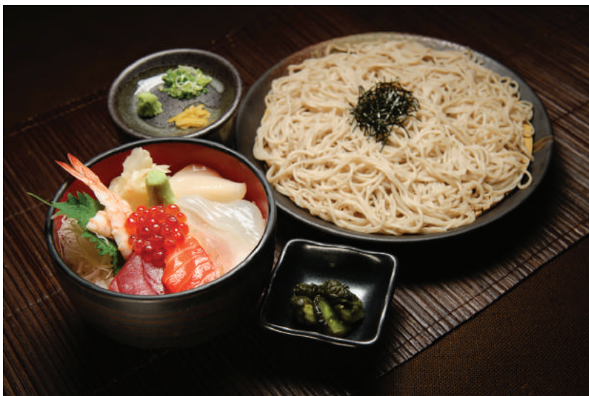
Kaisen Don Set

Consuming raw or undercooked food ( * ) such as meats, poultry, seafood, shellfish or eggs may increase your risk of foodborne illness.